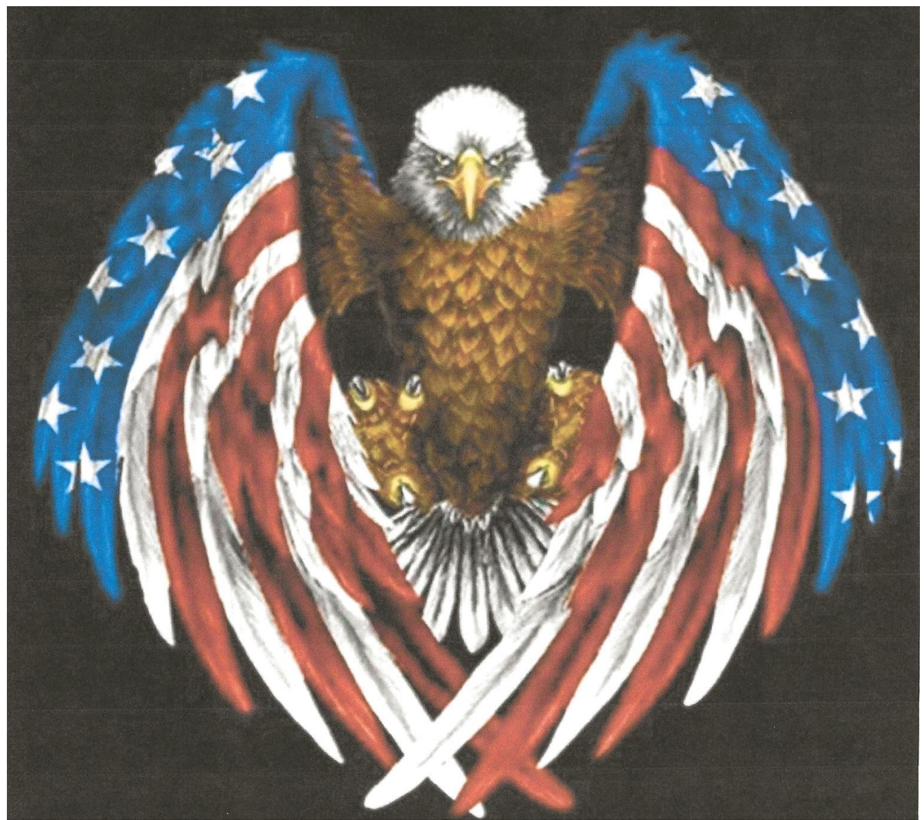
Another year how time fly's when we help veterans and their families and others from our hearts to theirs we need to continue to flay our Flag high and keep all our service personnel and their families in our prayers, if you see a veteran on the street or in a store thank them for their service as without them we would not have the freedoms we have. Thank you all for your support.